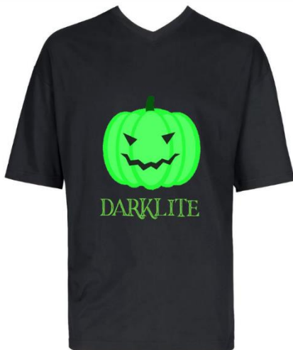
How it looks in dark environment