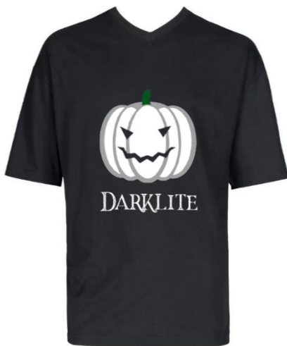
How it looks in a standard environment